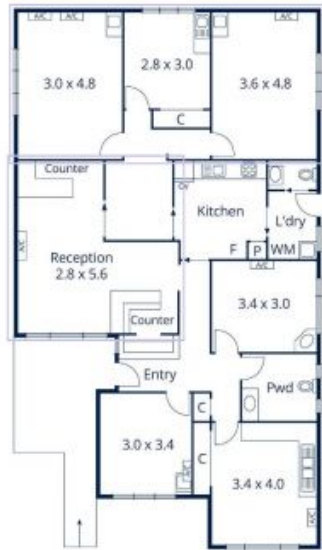
111 High Street - Floor Plan

All measurements are in metres. This plan is not to scale and provided as marketing material. All measurements are approximate and for illustrative purposes only. We make no guarantee of the accuracy of the plan, and you should independently determine the suitability of the property for your requirements.