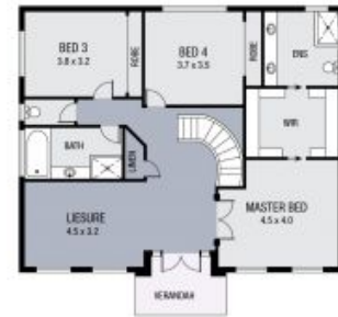
5 Taree Place, Mill Park