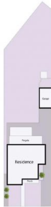
Site Plan (Current)