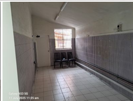
Galaxy A53 5G 11 July 2025 11:25 am