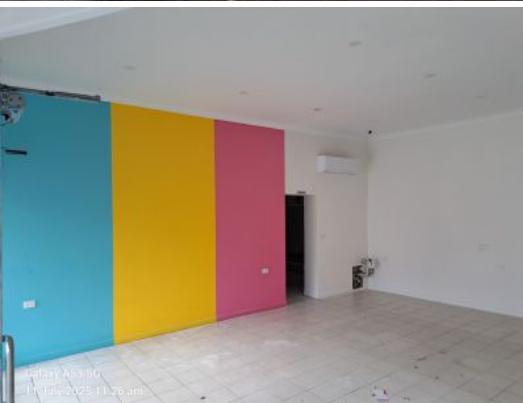
Galaxy A53 5G 11 July 2025 11:26 am