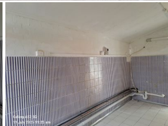
Galaxy A53 5G 11 July 2025 11:25 am