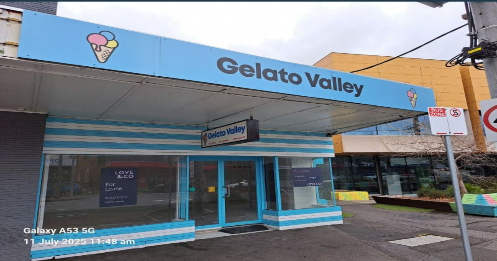
Galaxy A53 5G 11 July 2025 11:48 am