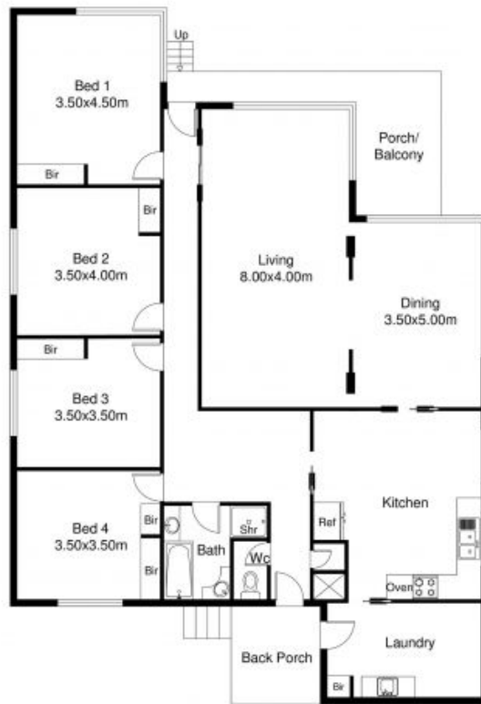
LEVEL ONE FLOOR PLAN