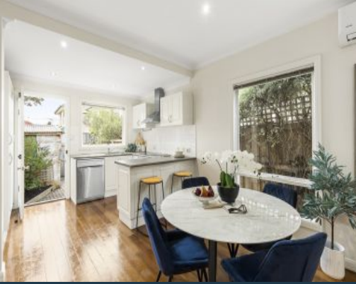
14 Kiewa Street Clifton Hill, VIC