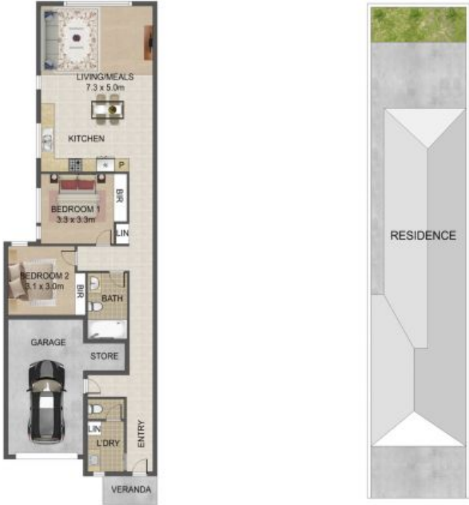
THE ABOVE PLAN IS AN ARTIST'S IMPRESSION ONLY, IT INCLUDES ELEMENTS THAT ARE FOR DISPLAY PURPOSES ONLY AND MAY NOT BE TO SCALE. LANDSCAPING SHOWN IS INDICATIVE ONLY. DIMENSIONS ARE APPROXIMATE.