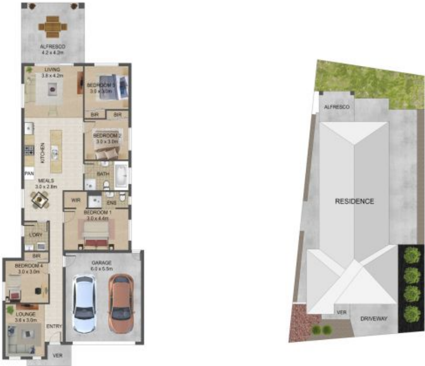
THE ABOVE PLAN IS AN ARTIST'S IMPRESSION ONLY, IT INCLUDES ELEMENTS THAT ARE FOR DISPLAY PURPOSES ONLY AND MAY NOT BE TO SCALE. LANDSCAPING SHOWN IS INDICATIVE ONLY. DIMENSIONS ARE APPROXIMATE.