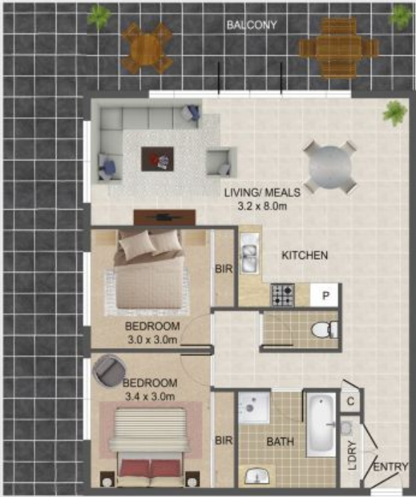
THE ABOVE PLAN IS AN ARTIST'S IMPRESSION ONLY, IT INCLUDES ELEMENTS THAT ARE FOR DISPLAY PURPOSES ONLY AND MAY NOT BE TO SCALE. LANDSCAPING SHOWN IS INDICATIVE ONLY. DIMENSIONS ARE APPROXIMATE.