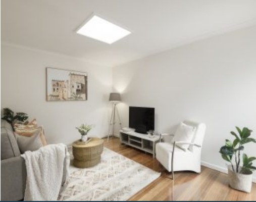
4/68 Bruce Street Preston, VIC