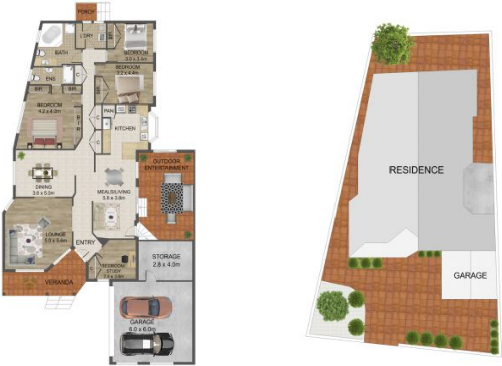
THE ABOVE PLAN IS AN ARTIST'S IMPRESSION ONLY, IT INCLUDES ELEMENTS THAT ARE FOR DISPLAY PURPOSES ONLY AND MAY NOT BE TO SCALE. LANDSCAPING SHOWN IS INDICATIVE ONLY. DIMENSIONS ARE APPROXIMATE.