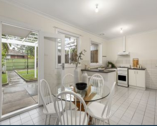
18 Livingstone Parade Preston, VIC