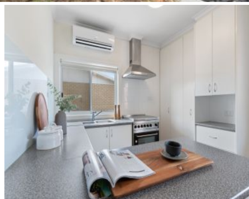
54a Barton Street Reservoir, VIC