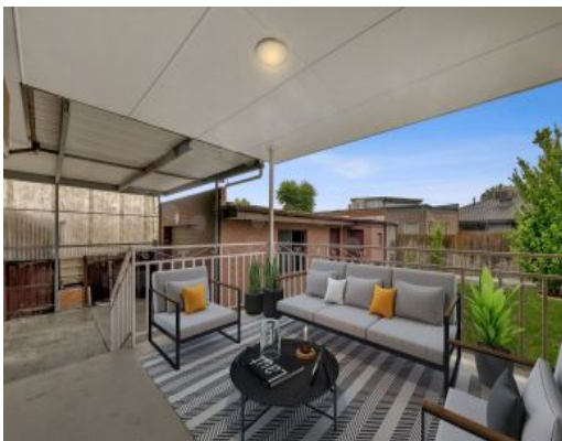
36 Memorial Avenue Epping, VIC