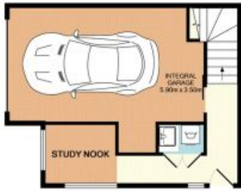
GROUND FLOOR APPROX. FLOOR AREA 35.2 SQ.M. (379 SQ.FT.)