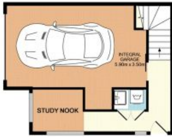
GROUND FLOOR APPROX. FLOOR AREA 35.2 SQ.M. (379 SQ.FT.)