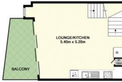
1ST FLOOR APPROX. FLOOR AREA 33.3 SQ.M. (359 SQ.FT.)