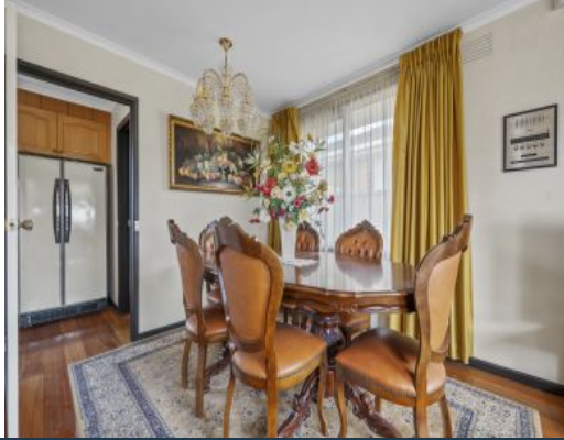
149 Edgars Road Thomastown, VIC