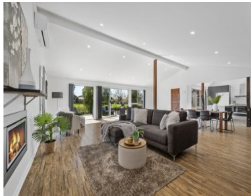
74 Robert Street Lalor, VIC