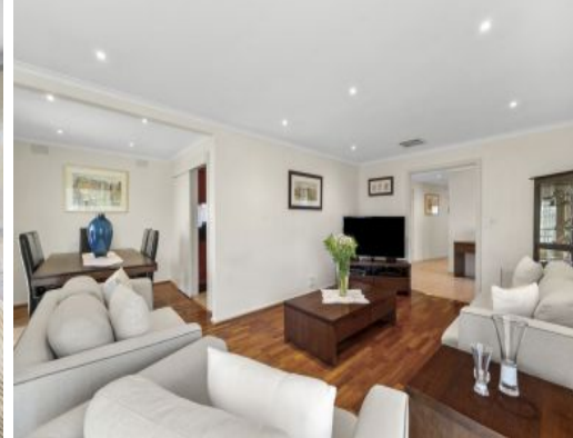
368 Dalton Road Epping, VIC