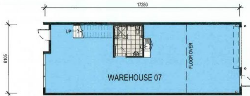
WAREHOUSE 07 - GROUND FLOOR