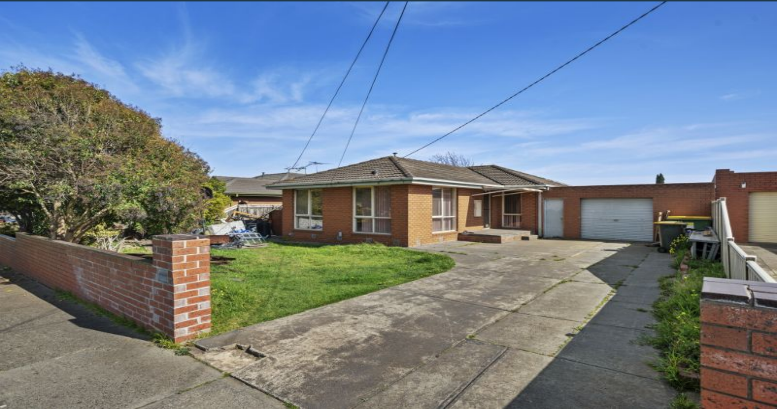
31 Carrington Boulevard, Thomastown