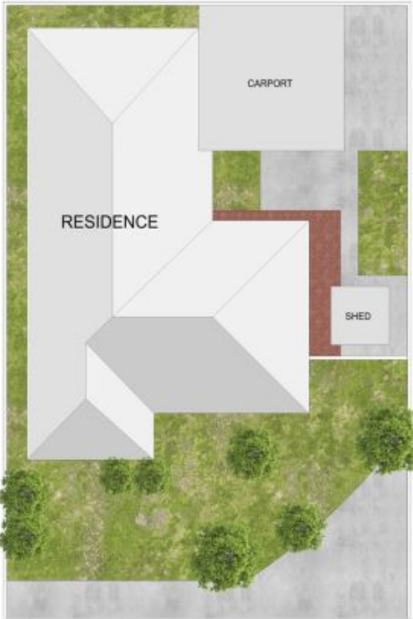
THE ABOVE PLAN IS AN ARTIST'S IMPRESSION ONLY, IT INCLUDES ELEMENTS THAT ARE FOR DISPLAY PURPOSES ONLY AND MAY NOT BE TO SCALE. LANDSCAPING SHOWN IS INDICATIVE ONLY. DIMENSIONS ARE APPROXIMATE.