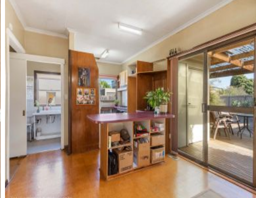
86 Barry Street Reservoir, VIC