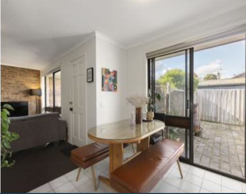
2/1 Gilbank Street Reservoir, VIC