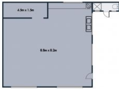
(NOT IN POSITION)