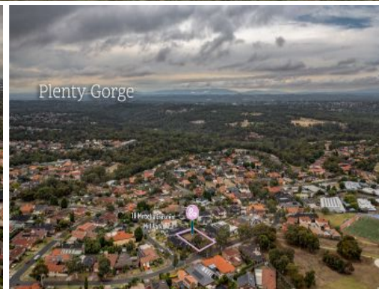
18 Mirbelia Crescent Mill Park, VIC