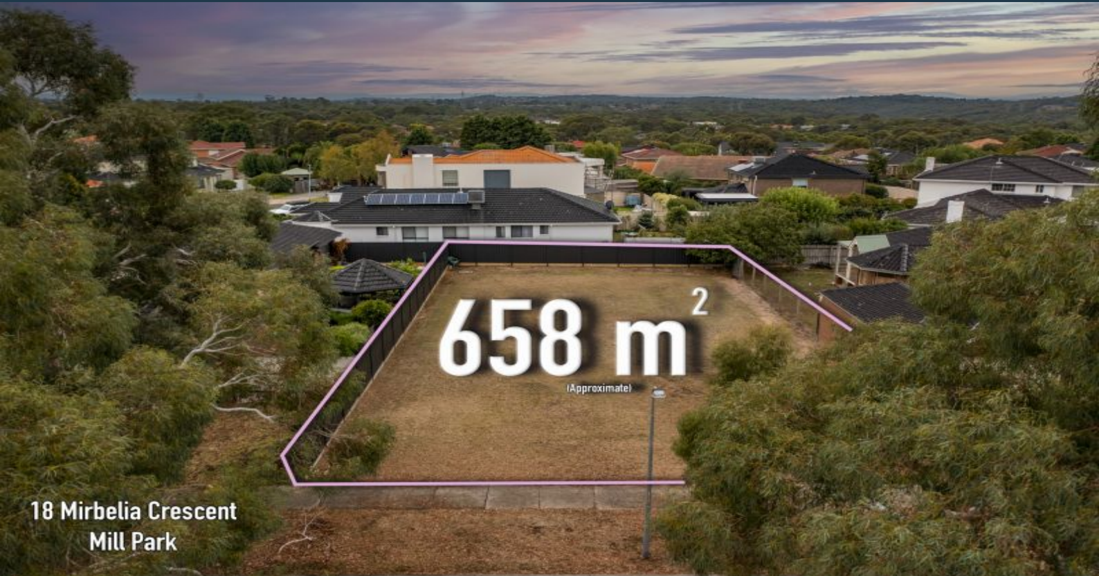
18 Mirbelia Crescent Mill Park