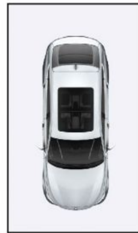
Car spaces In Basement (Not In Position)