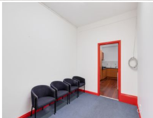
265 Spring Street Reservoir, VIC