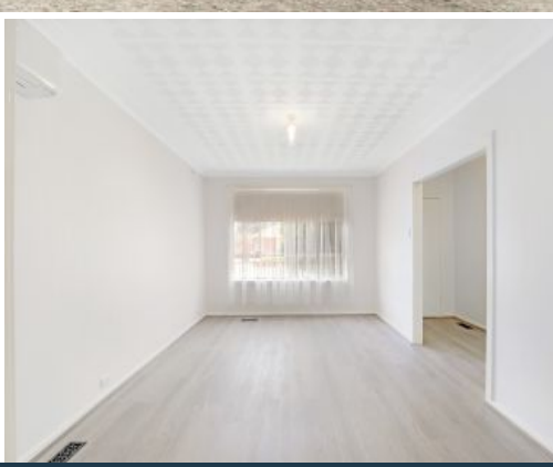
69 Partridge Street Lalor, VIC