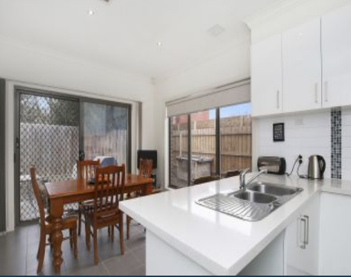
6/191 Gordons Road South Morang, VIC