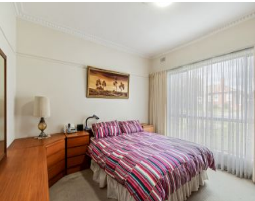
20 Vale Street Reservoir, VIC