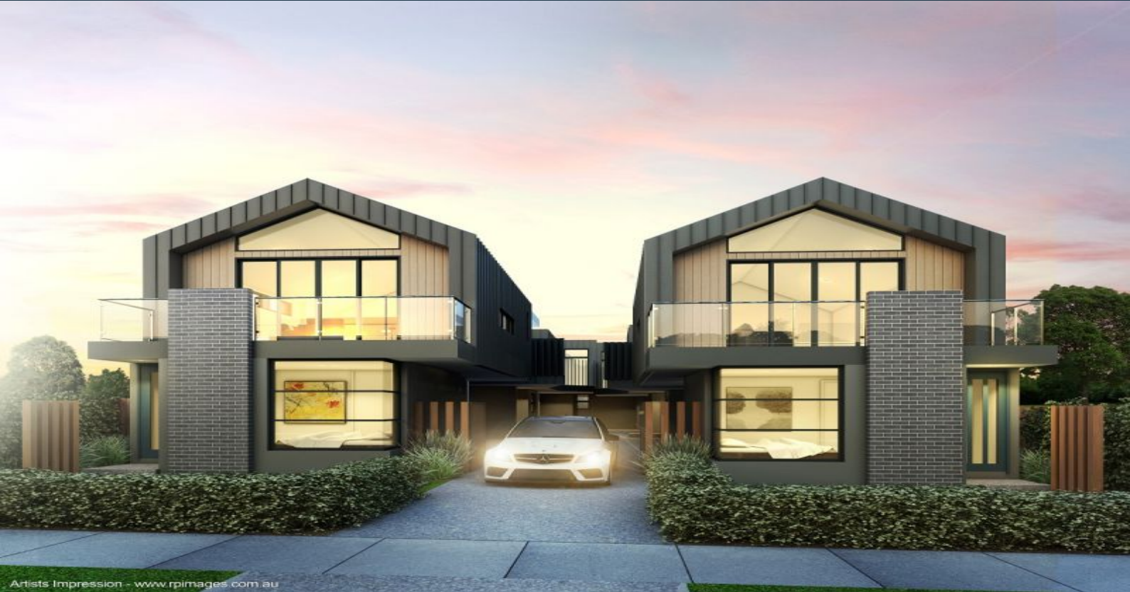
Artists Impression - www.rpimages.com.au