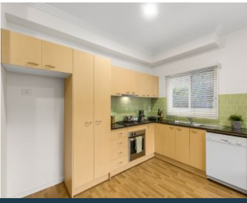
5/109 Flinders Street Thornbury, VIC