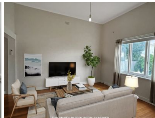
THIS IMAGE HAS BEEN VIRTUALLY STAGED.