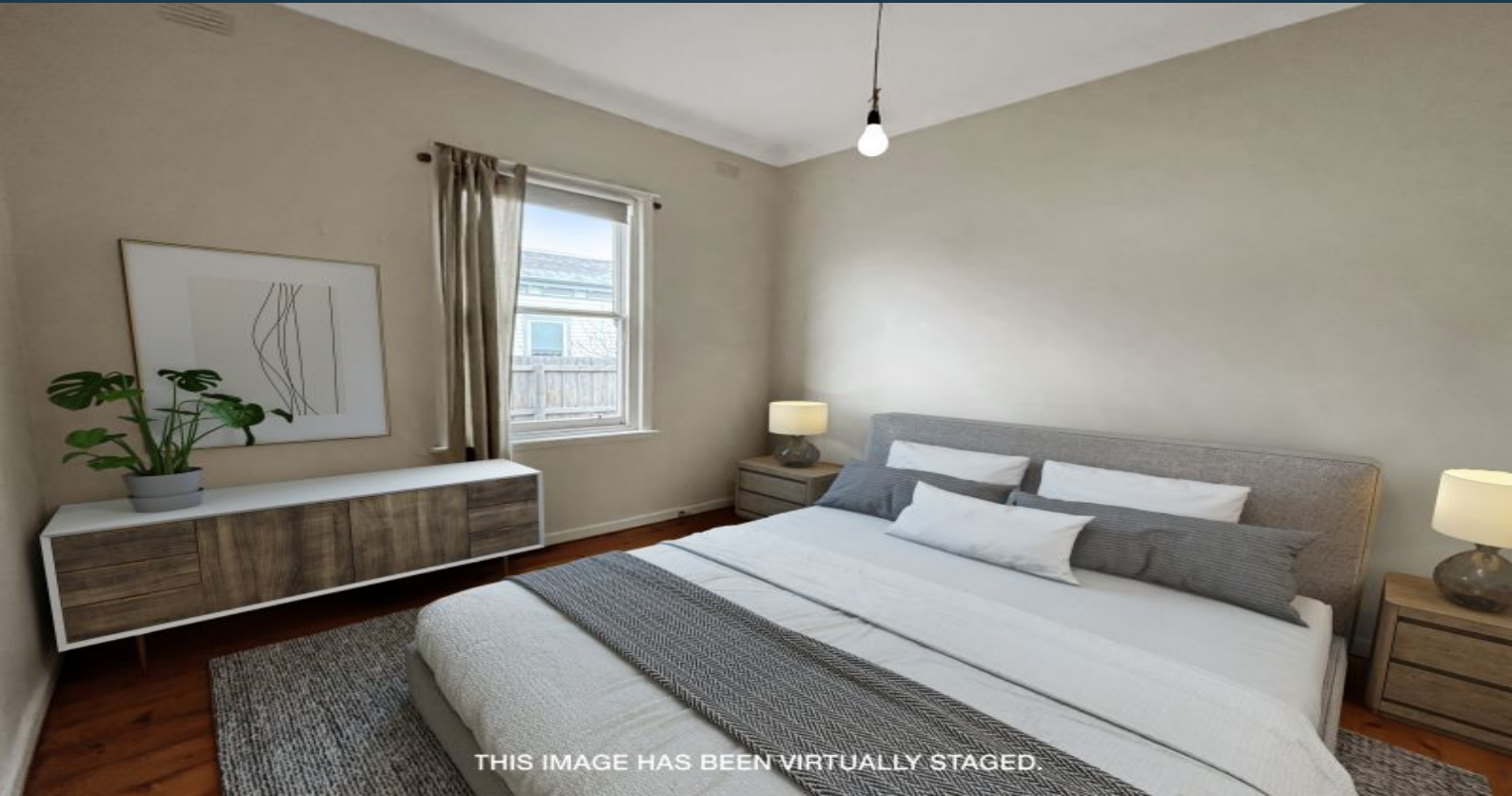
THIS IMAGE HAS BEEN VIRTUALLY STAGED.