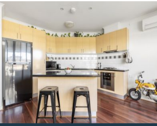
9/111 Beaconsfield Parade Northcote, VIC