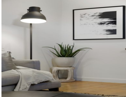
54/85C Clyde Street Thornbury, VIC