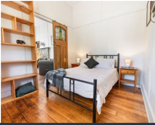
341 Ringwood-Warrandyte Road Warrandyte, VIC