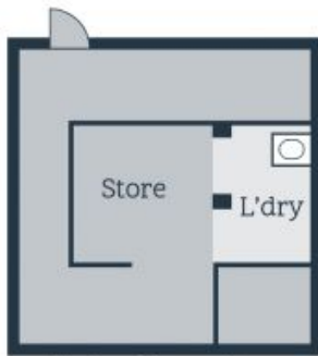
Under House Store