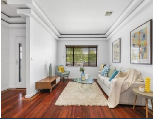
1/46 David Street Lalor, VIC