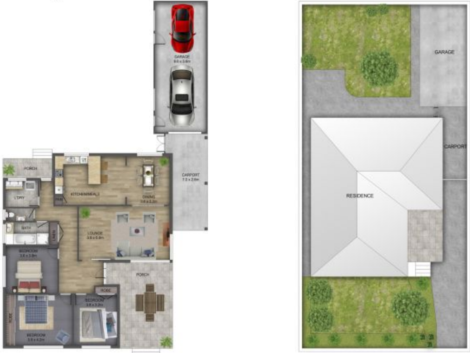
THE ABOVE PLAN IS AN ARTIST'S IMPRESSION ONLY, IT INCLUDES ELEMENTS THAT ARE FOR DISPLAY PURPOSES ONLY AND MAY NOT BE TO SCALE. LANDSCAPING SHOWN IS INDICATIVE ONLY. DIMENSIONS ARE APPROXIMATE.