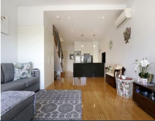
2/372 Bell Street Preston, VIC