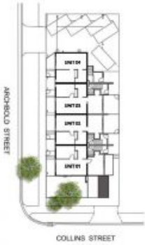
First Floor Level