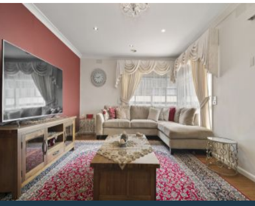
47 Rosemary Drive Lalor, VIC