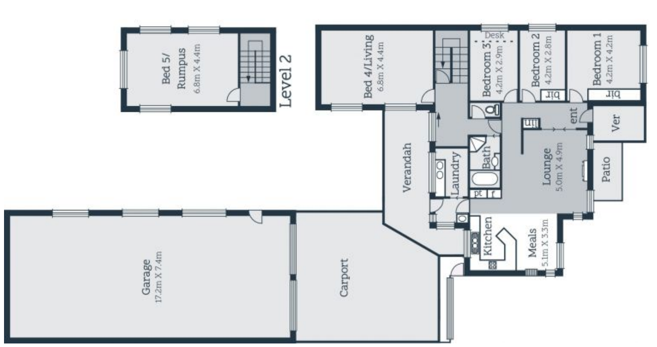
Every precaution has been taken to establish accuracy of the information in this brochure but does not constitute any representation by the vendor or agent