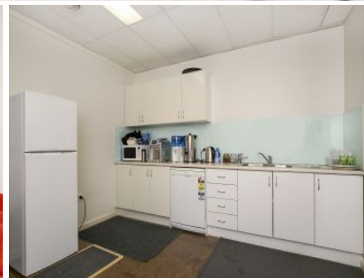
Rear 38-40 Main Street Greensborough, VIC