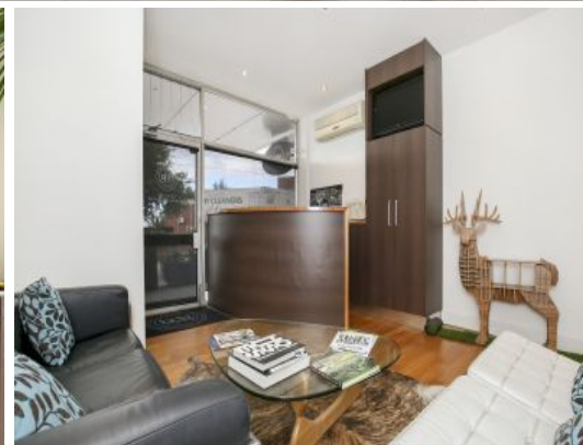
667 Plenty Road Reservoir, VIC