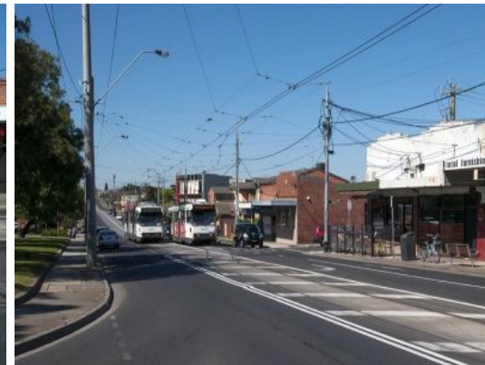
595 Gilbert Road PRESTON, VIC