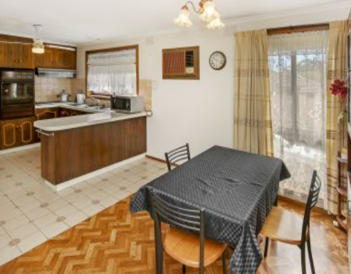
1/8 William Street Greensborough, VIC