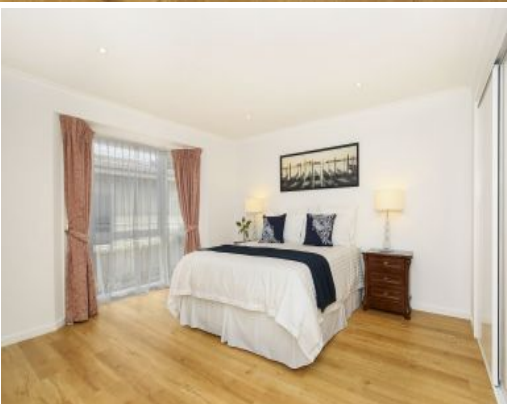
2/4 York Street Reservoir, VIC