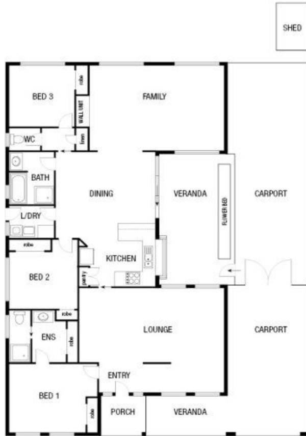
30 Streeton Circuit, Mill Park