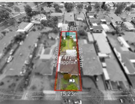
172 Rathcown Rd. Reservoir